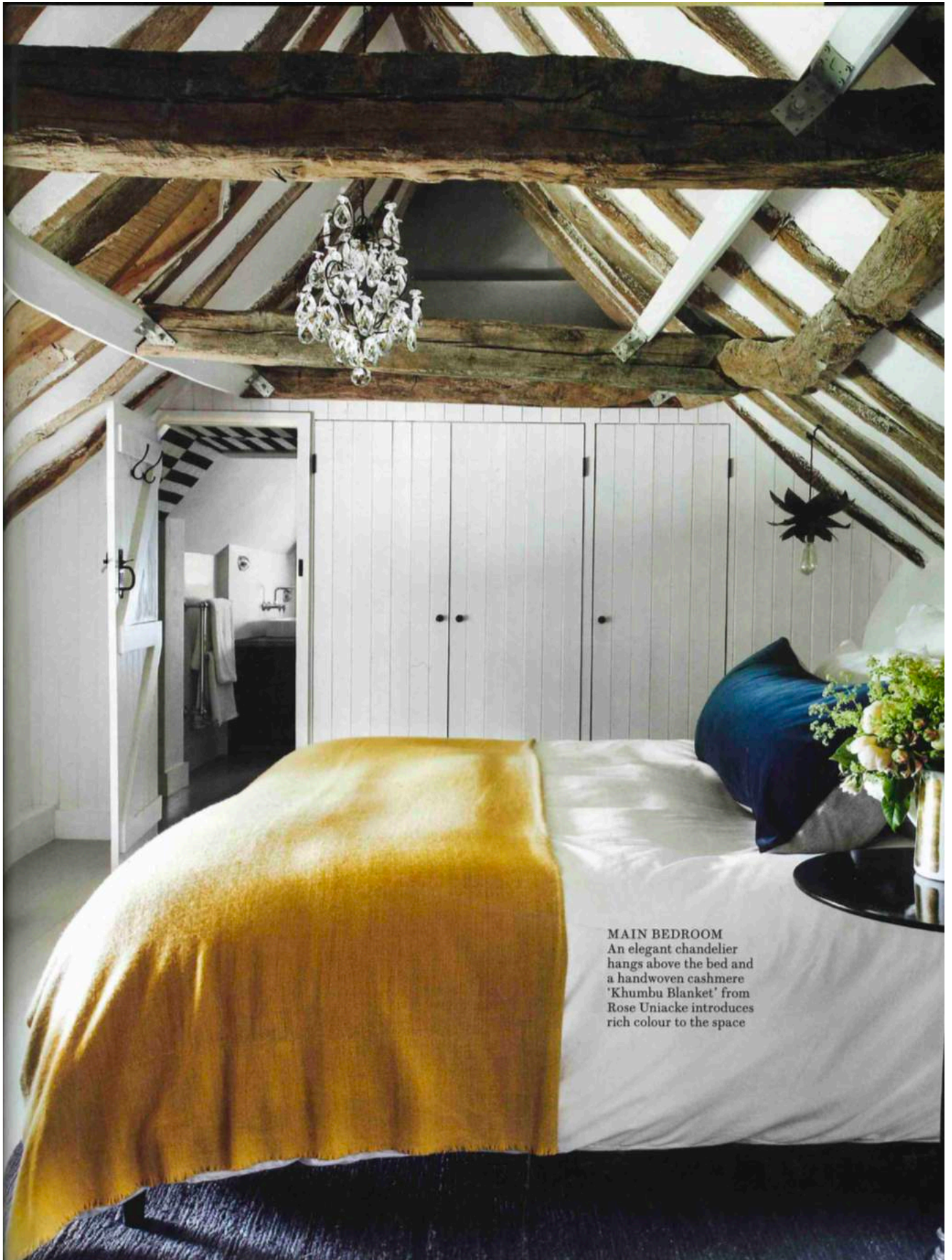
MAIN BEDROOM An elegant chandelier hangs above the bed and a handwoven cashmere 'Khumbu Blanket' from Rose Uniacke introduces rich colour to the space