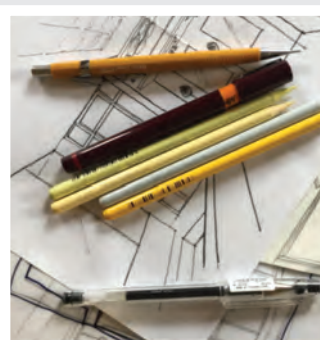
#favoritetools love sketching, especially for the restoration of a home in the South of France

Victoria & Albert Museum vam.ac.uk, @vamuseum