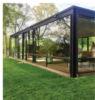
#theglasshouse honored to be on the advisory board of this legendary 1949 #philipjohnson beauty