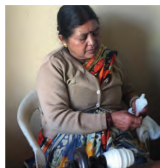
#handmade in northern India I stumbled across local weavers making #pashminas