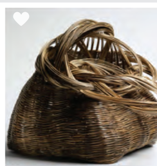
#shouchikutanabe this Japanese bamboo artist's work is substantial and inspiring #thev&a