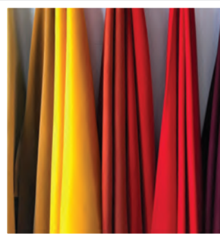
#funfabrics vibrant jewel tones at my new RU Fabric shop in #thepimlicoroad design district

You're really going to ♥ Rose Uniacke's design-world posts