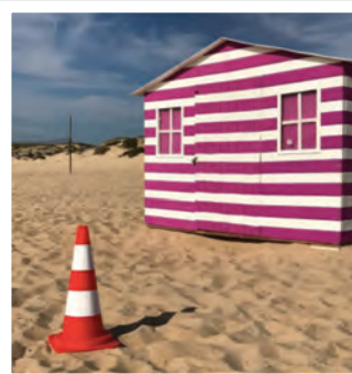
#smartstripes an unforgettable family holiday on the beach in Portugal #comporta